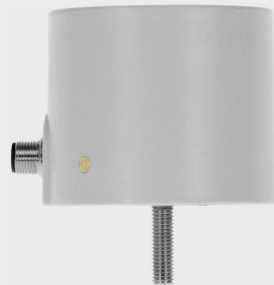
Type: IPJ 090