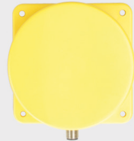
Type: IPN 105