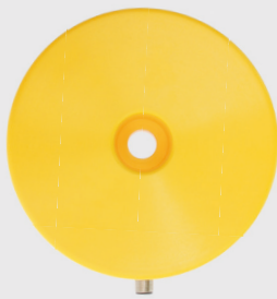
Type: IPO 150