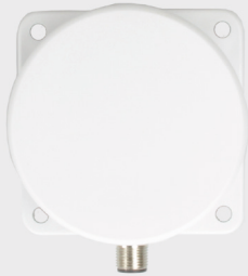
Type: IPK 080