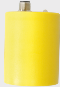
Type: IPH 055