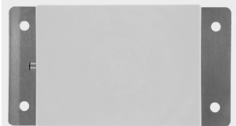
Type: IPU 215